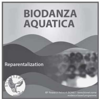
FIGURE 4.1. Examples of evidence-based Biodanza programmes (Logos).